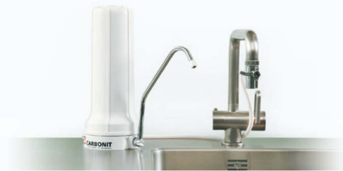
CARBONIT® SANUNO tabletop filters: inexpensive, flexible, quick to install.

Simple. Safe. Practical. Good. Carbonit Filters in your kitchen.