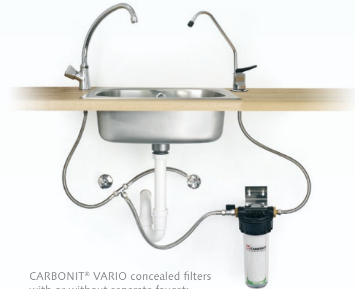
CARBONIT® VARIO concealed filters with or without separate faucet: easy to use, just the way you like it.